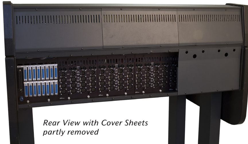
Rear View with Cover Sheets partly removed

console frame. You will find the necessary screws in the accessories box. The armrest has been prepared for mounting at the factory. It's fixed by screws thru holes in the frame. Please check for the pre drilled holes in the armrest, put it in place and fix the armrest from the inside. If the modules are installed, you need to remove modules to access the holes.