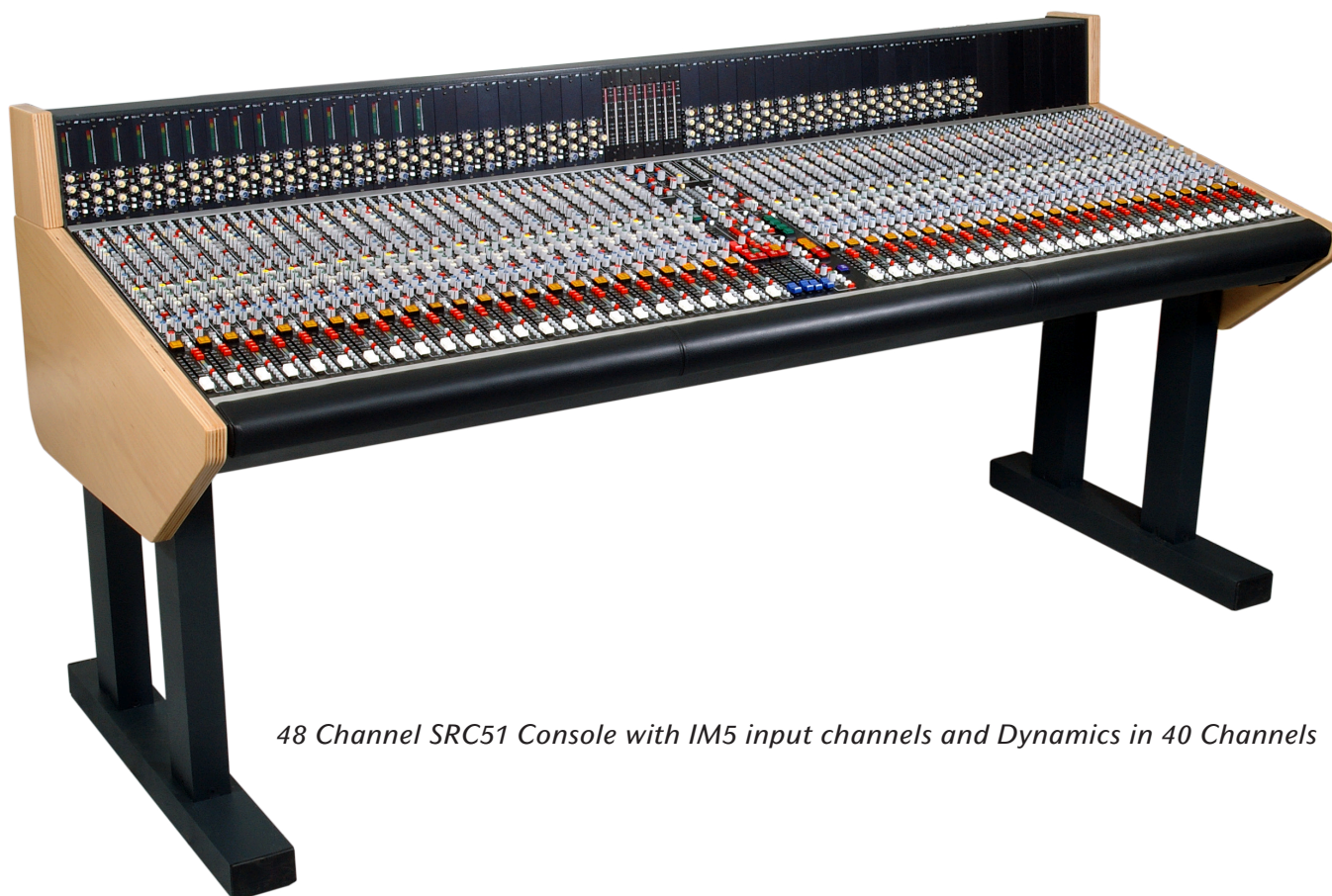
48 Channel SRC51 Console with IM5 input channels and Dynamics in 40 Channels

SRC51 console frames are available in many different versions. Almost any frame size with an even number of module slots is possible. The maximum, overall width of a single frame is 3900 mm. Such a frame has 96 module slots. Several smaller frames can be combined to form a rig on a common, special floorstand. All frames are basically floorstand versions, but up to a width of approximately 1500 mm, desktop and build-in version are possible.