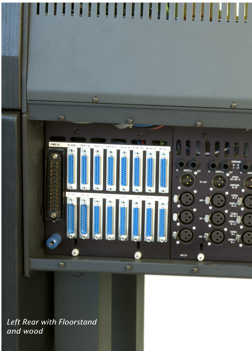
Left Rear with Floorstand and wood

In case that the transport is very complicated, the armrest might not be mounted. If this is the case you need to fix it to the rectangular tube at the front of the