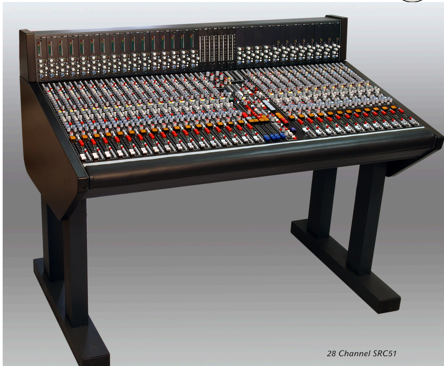
28 Channel SRC51