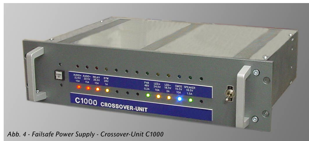
Abb. 4 - Failsafe Power Supply - Crossover-Unit C1000

The cross over unit is a 3U high rack mountable device. The total width of the front panel 483 mm. The actual width behind the top plate is 440 mm. Without attached connectors the C1000 and C1500 are approx. 320 mm deep. The only differences between the C1000 and C1500 version are the current of the diodes and the type of connectors that is used. While the C1000 uses diodes for a current load of 10 amps and a 20-pin connector,